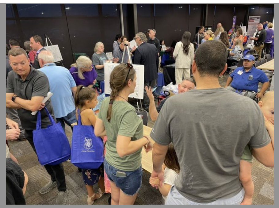
Thanks to all who attended our Feb. 26 Community Open House. You asked great questions, exhibitors gave out helpful information and we enjoyed meeting you in person for casual conversation. We'll do it again!