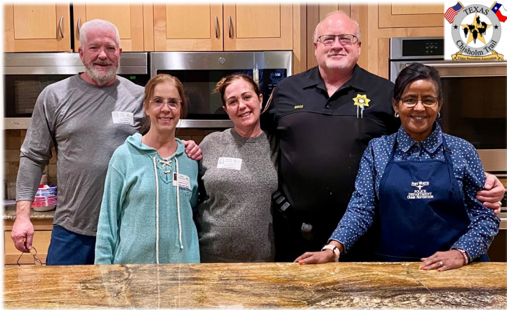
TCTCPA cooks monthly for families at Ronald McDonald House