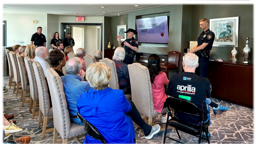
Downtown Security Group