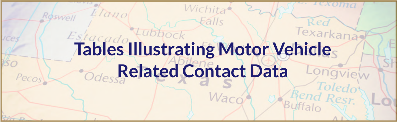
Table 1. Citations and Warnings