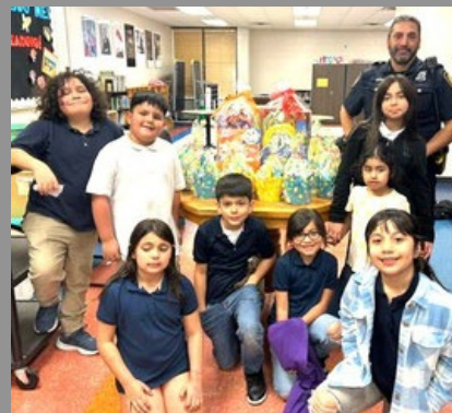
NPO Massey delivered Easter baskets to North Tri-Ethnic Community Center. Donated baskets were made or bought by Northwest Division officers and staff for the center's Easter Hopping.