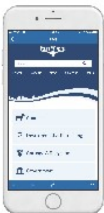
FAQ Quick access to City of Fort Worth website.