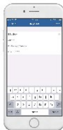
Reporter is your user information.