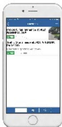
Favorites Lists all marked Service Request for easy monitoring.