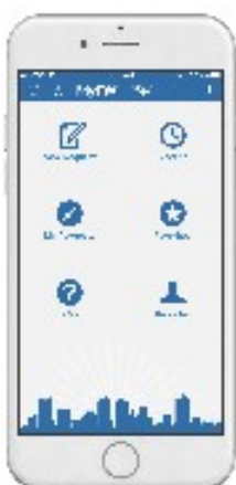
Main Selection Screen