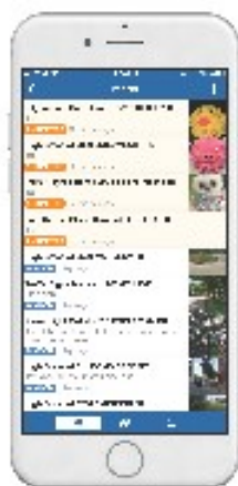
Recent Lists all Service Requests recently submitted.