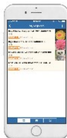
My Request Lists all your Service Requests.