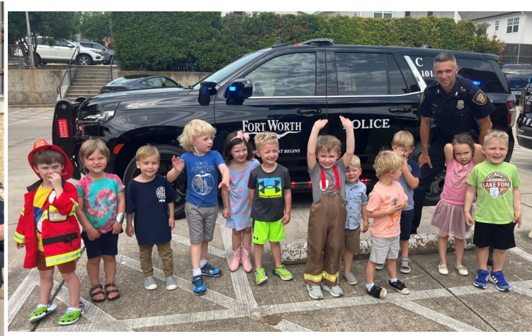
St Stephen's Career Day Event

FLASHBACK Photo above was taken in 2018 for National Police Week. Location is the front steps of the Central Division Jones Street Sector.