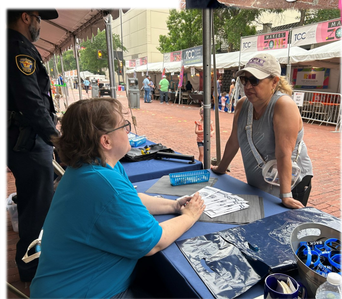
Photos from Crime Prevention Display at Fort Worth Arts Festival