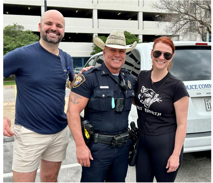
Crime Prevention Display at Safety Day Harris Hospital. Photos show Bikers Against Child Abuse and NPO with Council Women and Event Coordinator