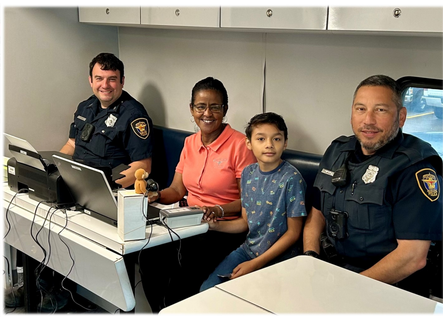
Child Id's offered at Holy Name Church at the Dia de Nino Celebration 41 children processed