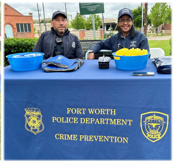
Crime Prevention Display Evans Plaza Kidney Awareness Celebration Day