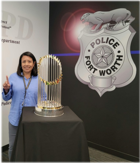
Rangers World Series Trophy visits FWPD